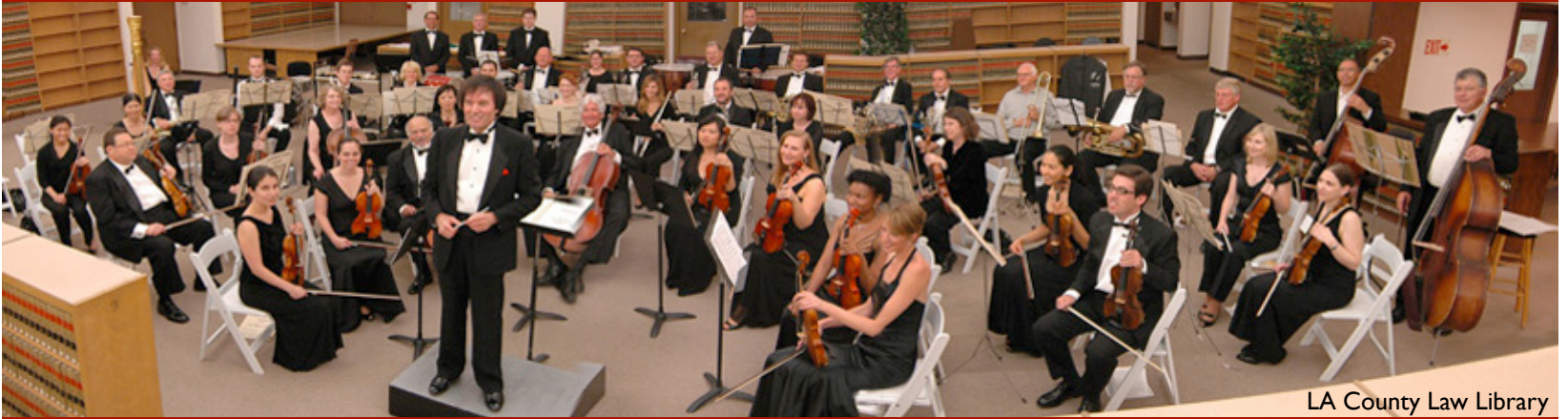
LA County Law Library